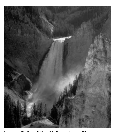
Lower Falls of the Yellowstone River

The spectacular Grand Canyon of the Yellowstone, including Upper and Lower Falls of the Yellowstone River, can be seen from the overlooks and trails of the Canyon Village area, and from the Tower Fall and Calcite Springs overlooks south of Tower Junction.